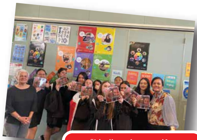
"I believe in myself now. I have a positive future" -ShineGIRL participant