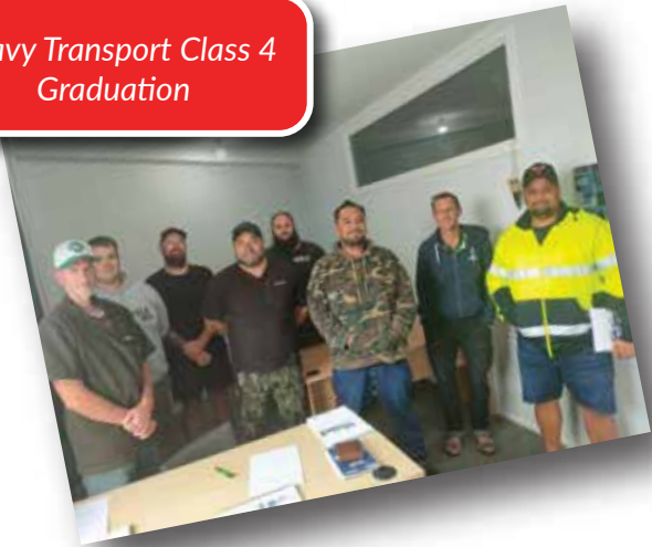
Heavy Transport Class 4 Graduation

She has many goals for the future and expressed that one was to be a truck driver and drive tanker trucks for Fonterra. I smiled and with a raised eyebrow informed her that I could help with that dream and the next program was in May. She sat in silence completely dumbfounded by my offer. I told her we could assist her up to the Class 4 and that she had what it takes to achieve all this by mid-November. With a grin on her face, she said 'thank you for having so much faith in me. I'm getting nervous and excited all at once and it's not until May.' She walked out my office door like she had just won the lottery. My guess is that this young woman is about to embark on an adventure of a lifetime.