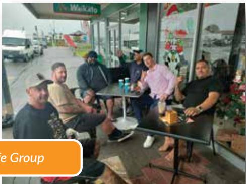
Mens Life Group

The Men’s Life Group has continued to provide an avenue for forty-nine local men, to connect five days a week to build community in a positive environment. Gym sessions, helping in the community and regular trips to the Cow Café, see our men re-establish routine and structure for a healthy body and mind, which assists them to re-enter the work force.