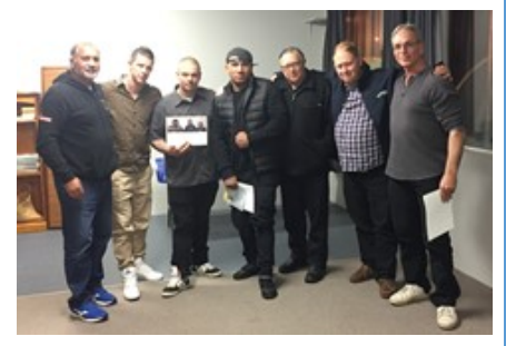
Men's Program Graduation

I have always found Transform Aotearoa staff professional and engaging and frequently meet with them, with regards to their program content and the need of our mutual clients.