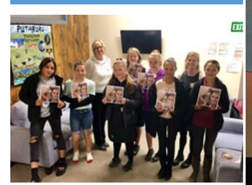
Shine Girl Putaruru College

This week we delivered a Barista coffee essentials course in the community. One lady said she was amazed at how well she did and was able to keep up with the practical and theory components of the course. She was surprised by her own ability. She said if it wasn't for Transform and the ladies program she would never have had the confidence to even try and do a course like this. She left feeling really proud of herself which she hadn't felt in a really long time.