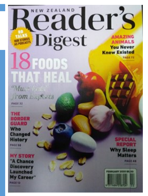
Our Moment to Shine

This week one of our loved. valued and appreciated ladies was involved in a serious domestic violence dispute with her partner. She is lucky to be alive and on route to Waikato the ambulance personnel attending her said it is the worst they have seen in many years and she was lucky to be in an ambulance and not a hearse. She is being looked after and relocated by the women's refuge for her own safety. She had been in contact with one of the facilitators and a fellow class mate and thought she may stay away from class for a couple of weeks until the bruising had gone down. However battered and bruised she still braved coming to class. Not wanting this to define her or stop her from living her life. She said that if it wasn't for Transform in her life she would have been a blubbering mess at home isolating herself from the world. She said it is what it is and I can't do anything about it. She fluctuates between laughter and tears to deal with situation. Coming back to class was her way of choosing to move forward and be where she knows she is supported and loved. She said over the last 5 days she has felt loved and valued more than in the past 5 years. Transform presented