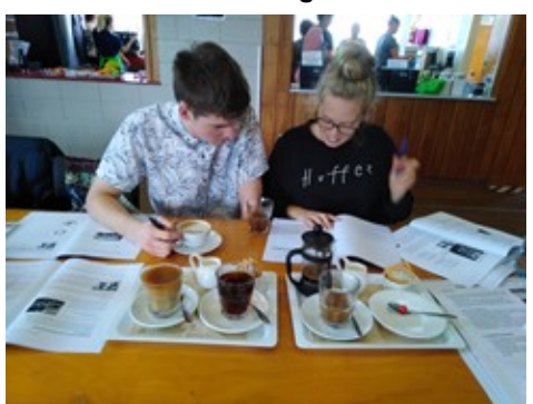
Barista Training Theory

I have involvement with many organisations offering programmes in the community and I can honestly say that Transform is one organisation which I will refer people to as they get results and positively impact the community.